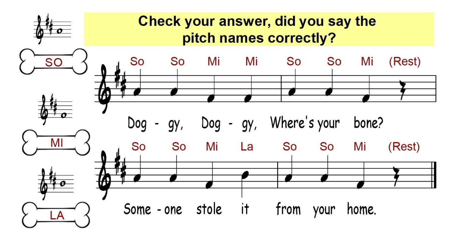
Now, play the game!!

#3 - Check to see if you read the pitch names correctly. Then sing the song!